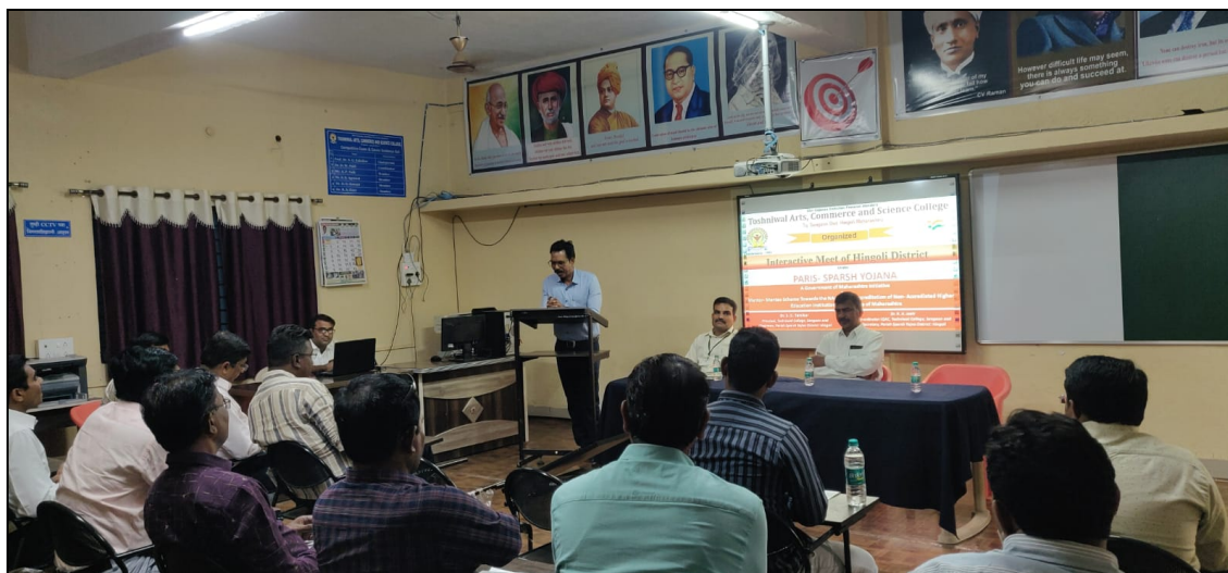
Participant's participation in discussions